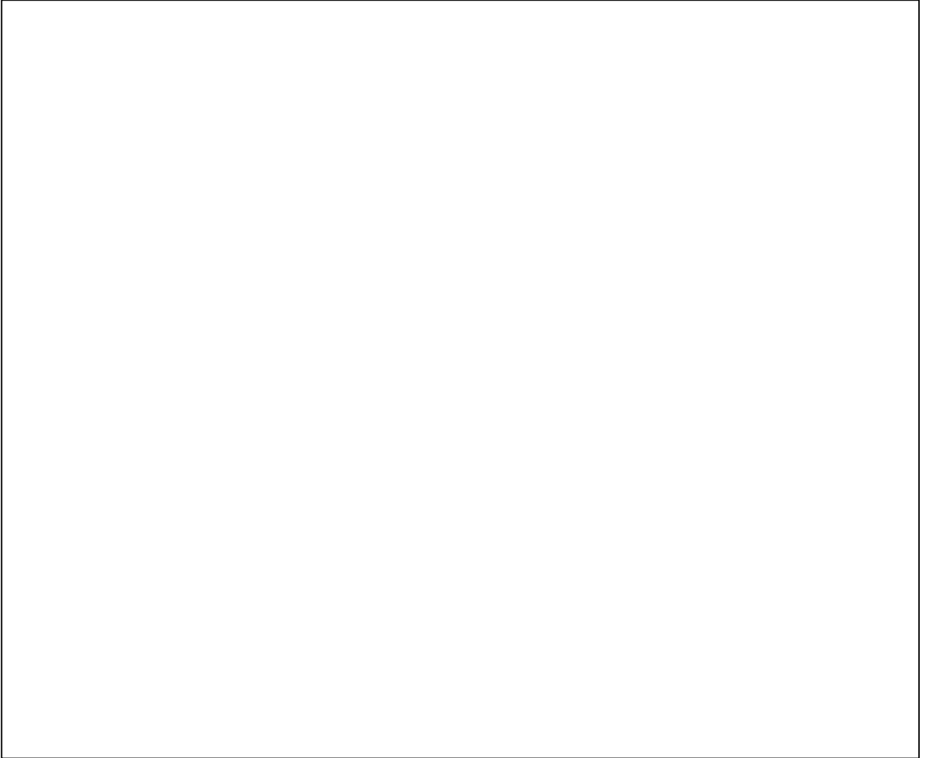
Sample of how to draw your map

Draw a road map to your home indicating major landmarks and a well known name of a family member